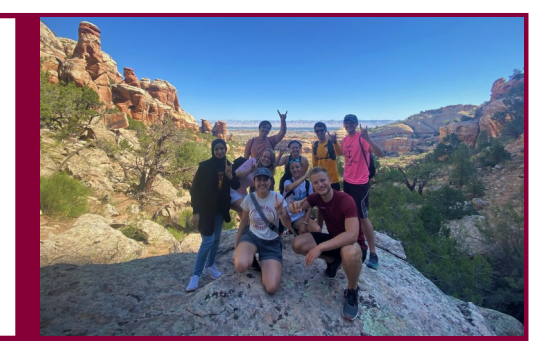
Updated: February 2, 2024

The CMU Outdoor Program is dedicated to outdoor adventure and education. It offers trip coordination, instruction and equipment rentals. Enjoy whitewater rafting, mountain biking, hiking, camping, cross country skiing, rock climbing and much more. The local area offers more than 1,200 miles of hiking trails for adventurers of all levels. Students interested in biking can rent a bike for a $250 deposit for one year. Learn more about CMU's Outdoor Program at this link: <u>coloradomesa.edu/outdoor-program</u>.