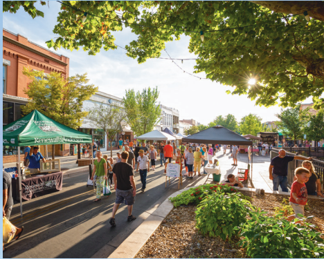
Downtown Grand Junction