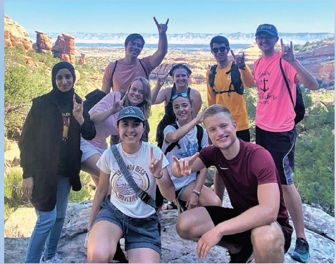
Colorado National Monument