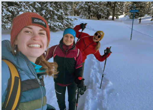
Grand Mesa National Forest