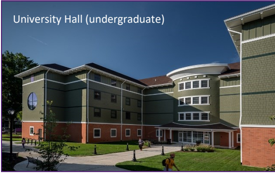
University Hall (undergraduate)