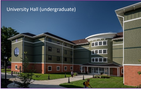
University Hall (undergraduate)